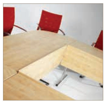
Modesty Panel Detachable modesty panels can be fitted as required