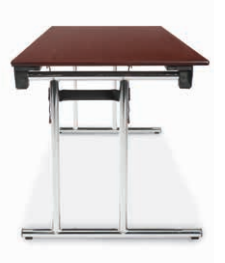
Leg configuration on 75cm wide table