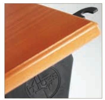
Clip Corner posts with integral stacking buffers minimise the possibility of stacking damage and incorporate a swivel clip to enable tables to be linked