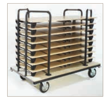
Table Trucks - TTF.C Tables can be transported easily from room to room on a custom-made table truck