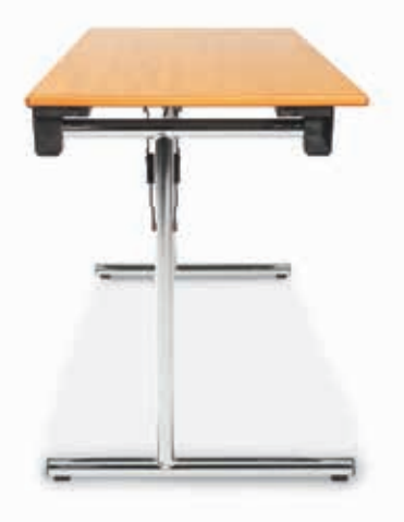
Leg configuration on 60cm wide table