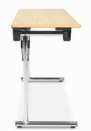
Leg configuration on 45cm wide table

A selection of table top finishes are available and the frames can be finished in a choice of chrome plated mild steel, or a wide selection of epoxy powder coated colours.